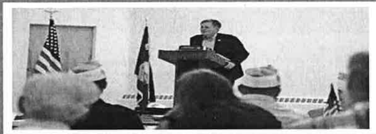
Celebrating Scobey's VFW's 100th Anniversary

In Montana, we're home to a rich legacy of service, and my family is no different. Growing up as the son of a U.S. Marine, I was taught the value of service before self. It is my honor to represent Montana's veterans. We must honor the men and women who put country over self, and put their lives on the line to protect our freedom.